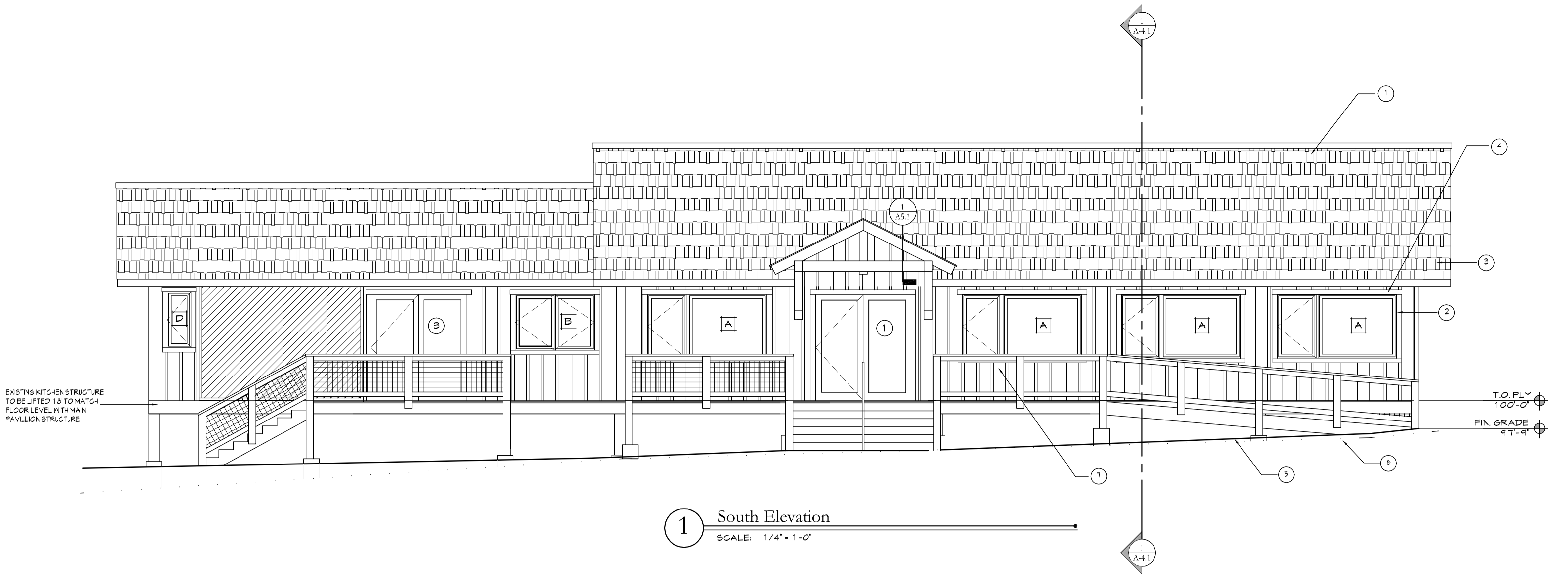
1 South Elevation SCALE: 1/4" = 1'-0"